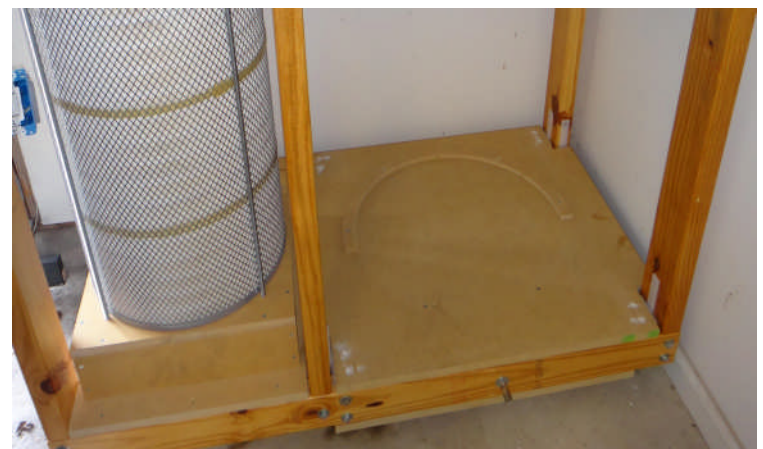
TRASH CAN BASE & FILTER – The base on the right is where the trash can sits. The half circle ring is used to position the trash can so it lines up with the separator. The filter is a Wynn Environmental (MERV15, pleated, open both ends) filter.