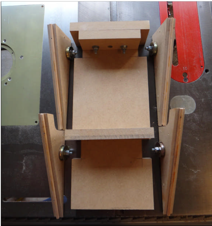
SLED – Partially exploded view showing sliding door rollers that will travel on ¼" dowels. ¼" dowels on ramps will be where rollers travel to raise base as sled moves forward. T-Nut captured in back between the two pieces of wood bolted together.