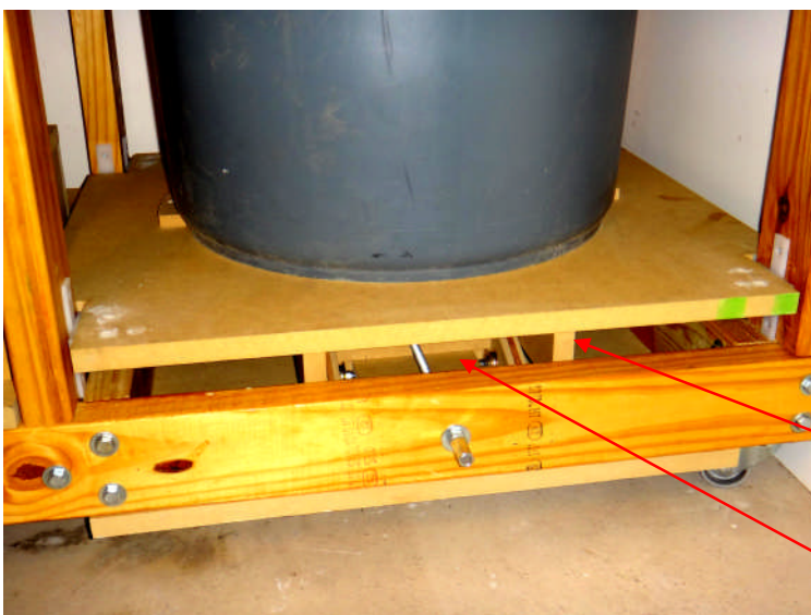
Frame attached to base plate